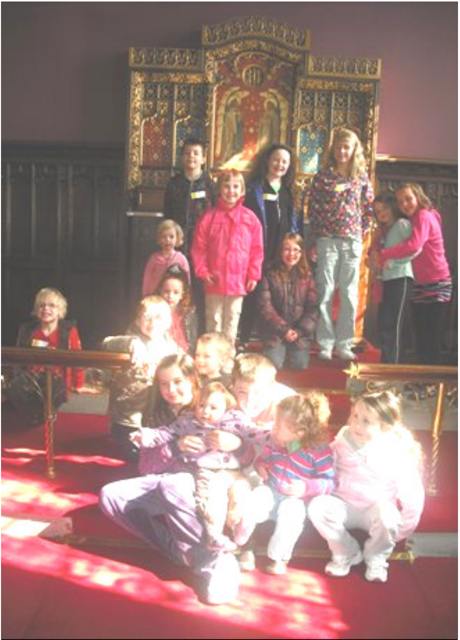
Young Church in Church at Good Friday Happening