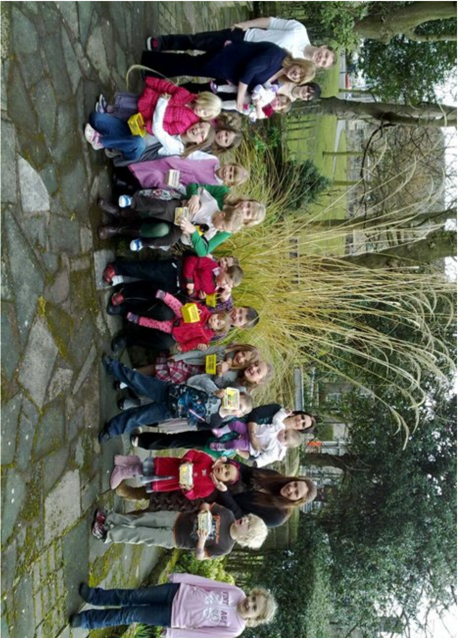
Young Church in Church Garden on Easter Day.