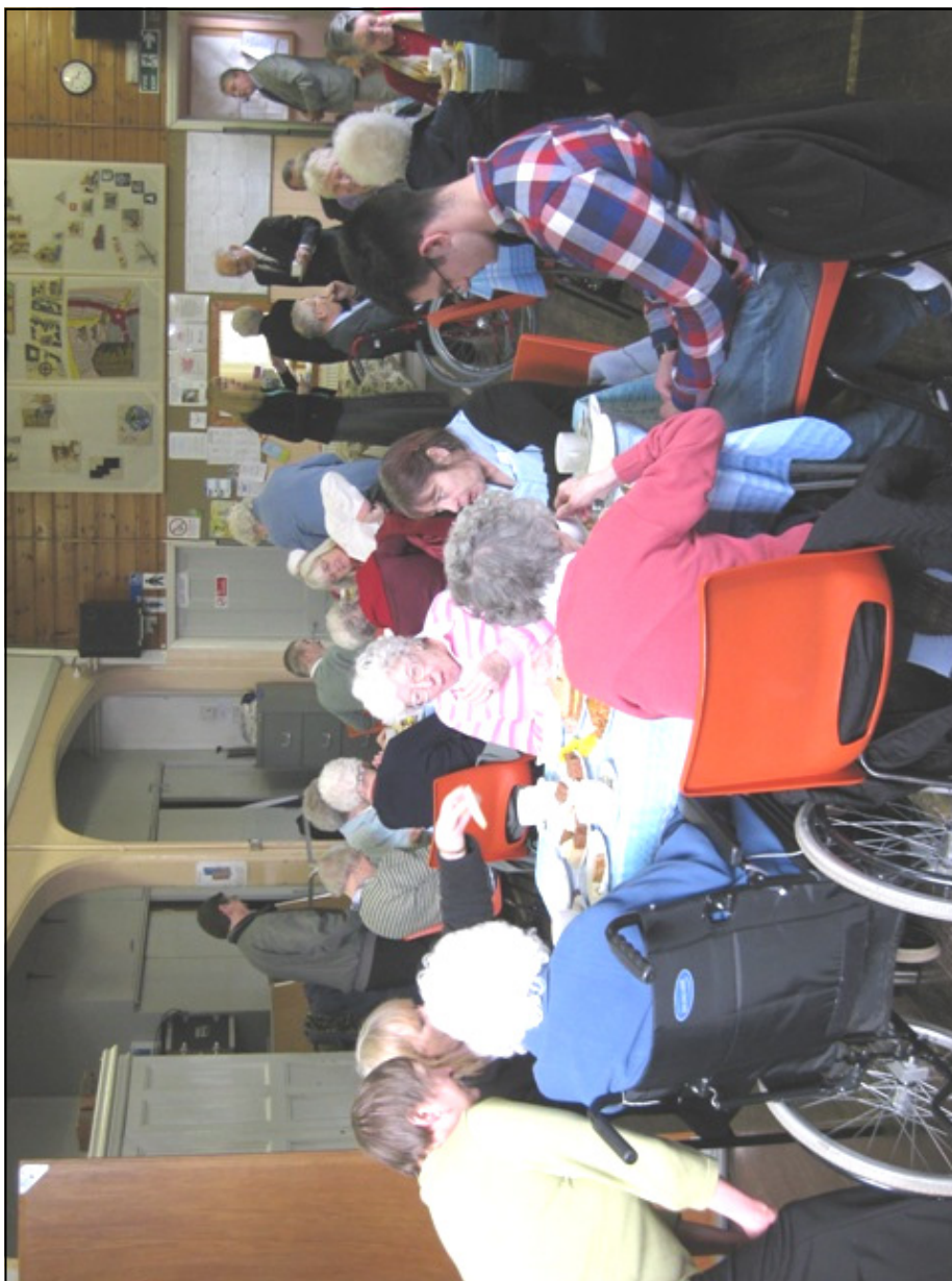
On Easter Day a Eucharist for 'At Home' members was held in the Church in the afternoon. Afterwards the congregation enjoyed tea and snacks in the Church Hall—see photo above.